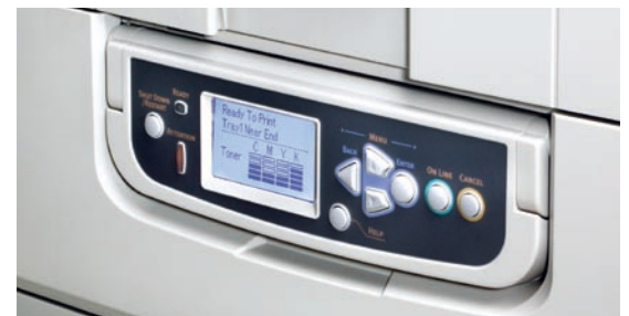
C9650 Series Operator Panel in “flat” or “down” position.