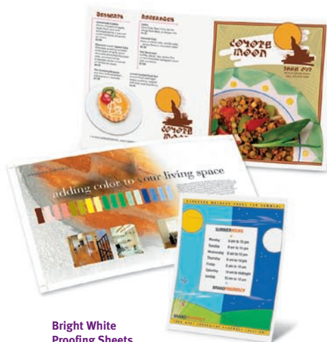
Bright White Proofing Sheets In 8.5" x 11", 11" x 17" (tabloid) and 12" x 18" (tabloid-extra)