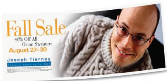
Banner Paper 12.9" x 35.4" or 8.5" x 35.4" – ideal for retail signage