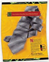
SynFlex™ Paper Water-resistant and tear-resistant