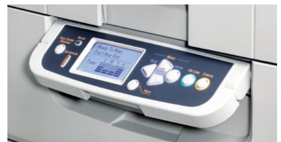
C9650 Series Operator Panel can be tilted upwards to various angles (up to 90°) for greater convenience.